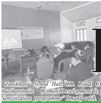
Zanikhan Synod Hall, I.B. Road, CCPur-ah NABARD huoihawtnain Women Development le inzawmin "Gender Sensitization programme" hmang a nih.