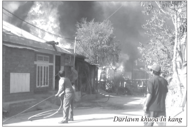
Darlawn khuoah In kang

Mizoram sung hmun hnan hnan haia kangmeiin mihriem chengna In 62 a kanghai hi a sunga thuomhnawhai